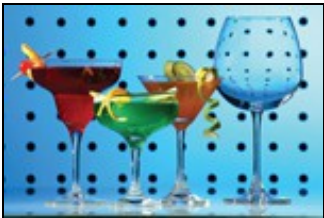
Food and Beverages